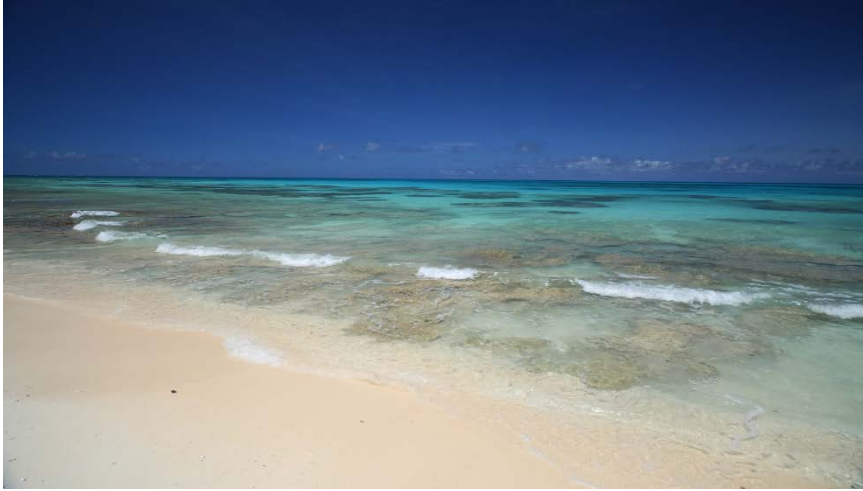
Nagamahama Beach (Video: https://youtu.be/7RldJ5te9oo )