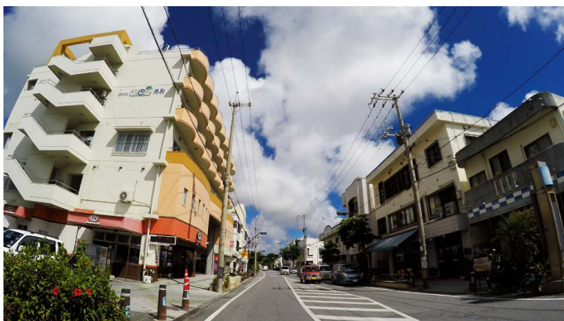
Hirara (Video: https://youtu.be/2tvAabrHHbU )

In the past Hirara was the central city of Miyako Island, but in 2005 there was a merger of neighboring municipalities creating the city of Miyakojima. People who have lived on the island for a long time still seem to call the area “Taira,” the colloquial reading of the characters. Today Hirara is simply the name of a district, but the area remains the center of Miyako Island. The center of Hirara has many hotels and restaurants and is crowded with tourists.