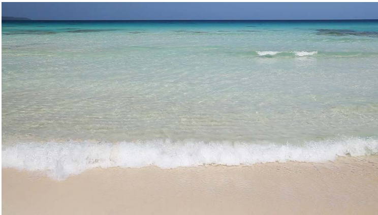
Sunayama Beach (Video: https://youtu.be/X8Ln3q9TH_k )