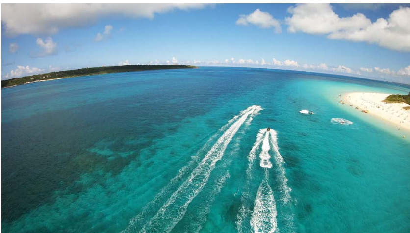
Yonaha Maehama Beach (Video: https://youtu.be/FmNwas9tqoc )

Known to the locals as just “Maehama,” Yonaha Maehama Beach has been chosen as the best of the top 10 beaches in Japan. It is indeed a beautiful beach representative of Miyako and Okinawa. The beach has a carpark, showers, toilets, and also a restaurant, so there is a bit of a resort-like atmosphere to the place. The white sand stretches for 7 km, and there are high-class resort hotels nearby. You can also see Kurima Bridge, and the contrast between the white sand and the cobalt-blue ocean is your typical image of a tropical land.