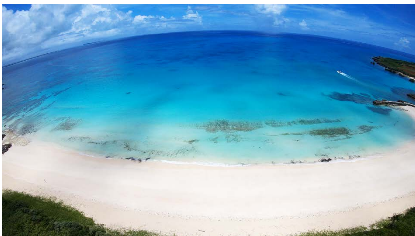
Toguchi Beach (Video: https://youtu.be/TWCbg2a4goI )

Shimoji islands, which are linked by land. In contrast to the showy image of Yonaha Maehama Beach on Miyako Island, this is a quiet, modest beach. It still gets few visitors, so there is plenty of room on the spacious shore. Since the opening of Irabu Bridge, however, the rush to construct hotels and other real estate has begun, so perhaps it is only a matter of time before crowds descend on this area as well.