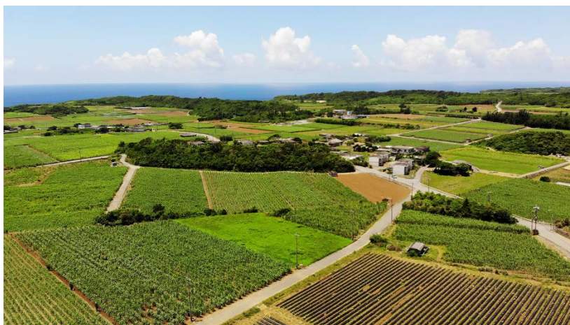
Sugarcane Fields (Video: https://youtu.be/gbfGKM3NeKo )

fields I could see houses---maybe farmhouses. The contrast with the threadlike roads was beautiful. It was a typical Okinawan scene.