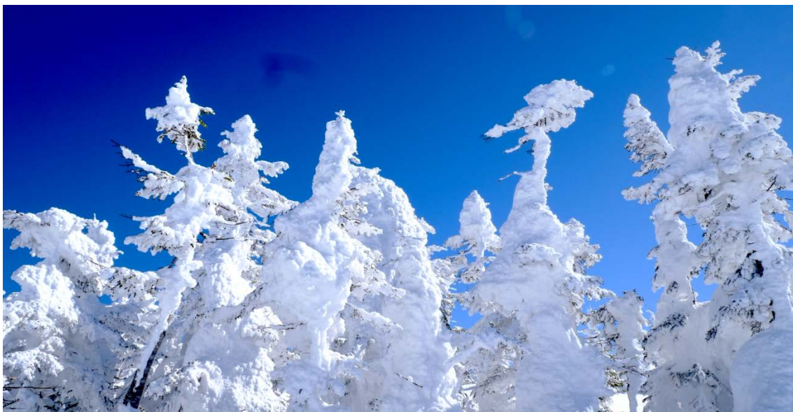
“Snow monsters” near the summit of Yokoteyama

The splendid view from the summit is not the only tourist attraction on Yokoteyama. Temperatures on the summit of the mountain in winter plunge to below -15 degrees Celsius, which causes supercooled tiny drops of water in the air to cling to trees and freeze, creating the wonderful phenomenon of frost trees. The towering trees lining the ski slope are covered in pure white costumes, and their strange shapes make them look just like white monsters. Indeed, in recent years, befitting a ski resort that kindles fantasy, people have come to describe them as just so---“snow monsters.”