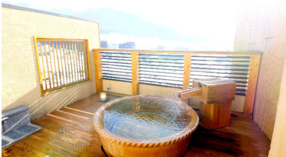
Rooftop outdoor hot spring at the Biyunoyado ryokan in Yudanaka Onsen

In this district, where the outside temperature plunges below -10 degrees Celsius, there are also public hot-spring baths that the locals use every day and that visitors staying in lodgings in the town can sometimes enter as well. It's fun to go out of your ryokan or hotel to take a dip in a public bath and experience the ordinary life of the townspeople.