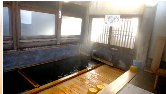
Public bath at Yudanaka Onsen