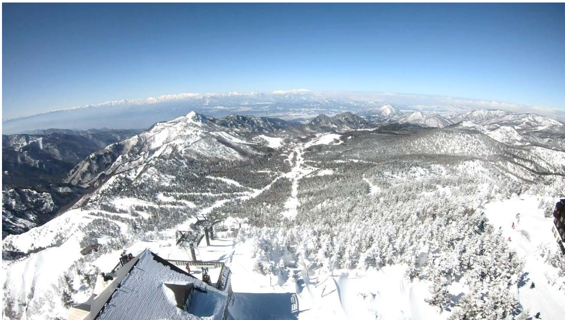
Yokoteyama-Shibutoge ski ground as seen from above by a drone

Snow and fantasy go well together. A panoramic silvery scene entices people into the unreal. Maybe for that reason, for skiers and non-skiers alike, the term “powder snow” has an appealing ring to it. Although there are not so many powder-snow ski resorts in Japan, one of the most famous on the main island of Honshu is Shiga Highland in Yamanouchi Town, Nagano Prefecture, which is also well known for having been a venue for alpine events during the Nagano Winter Olympics in 1998. Hearing that this ideal ski resort has tourist attractions enabling not only ski enthusiasts but everyone to enjoy a world of fantasy, I set off to report on it, armed not with a pair of skis but with a drone.